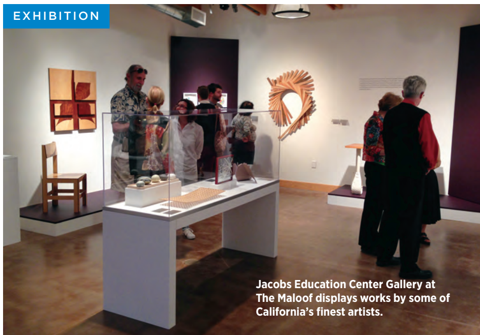
Jacobs Education Center Gallery at The Maloof displays works by some of California's finest artists.