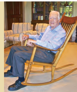
Jimmy Carter Maloof Rocker Walnut, 1985