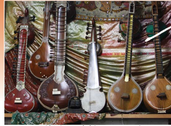
Don't miss With Strings Attached this spring in Jacobs Center.