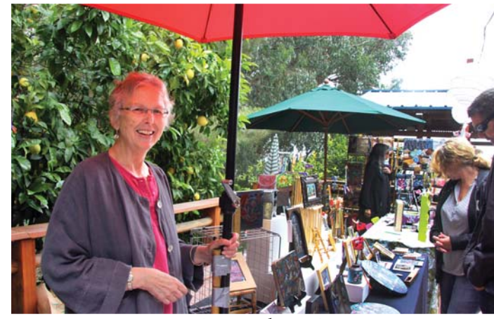
Summer Artisans' Sale coming June 1.

10 am – 3 pm Annual sale in the Discovery Garden by local artists and craftsmen